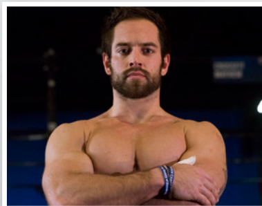
Rich Froning 3x Reebok® CrossFit® Games Champion