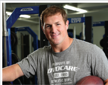
Jason Witten Pro Football Tight End