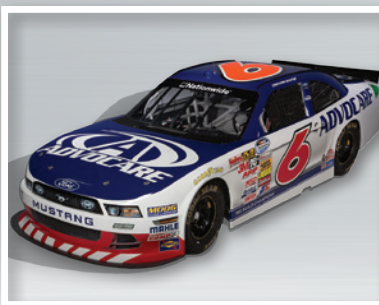
NASCAR® Nationwide Series