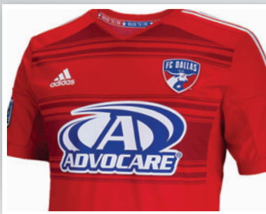
FC Dallas Jersey Sponsor

Endorsers began their relationship with AdvoCare as product users before endorsing the company. AdvoCare Endorsers receive a product allowance in exchange for their endorsement. Endorser testimonies reflect individual experiences and are not necessarily typical of the results you may obtain. Results vary with individual effort, body composition, eating patterns and exercise. If you have a medical condition or are pregnant or nursing, AdvoCare recommends you consult your healthcare professional before starting an AdvoCare product regimen.