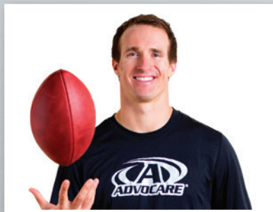
Drew Brees AdvoCare National Spokesperson