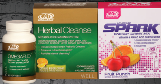
Cleanse Phase (Products) 10 Days