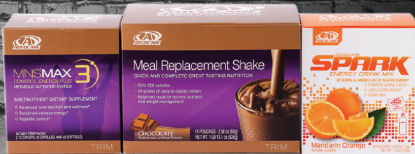
Max Phase (Products) 14 Days