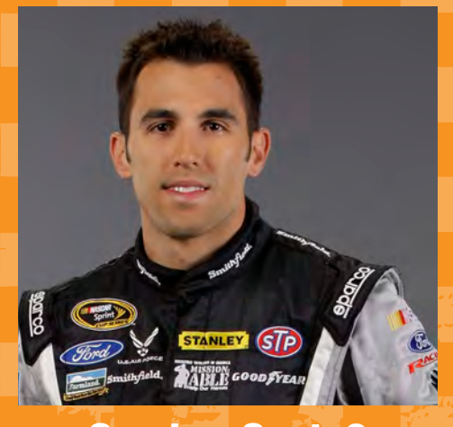
Sunday, Sept. 2 No. 43 Eric Almirola Sprint® Cup Series

Remember to hold your AdvoCare Race Day Mixer during Labor Day Weekend!