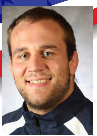
Tervel Dlagnev Wrestling Freestyle Champion